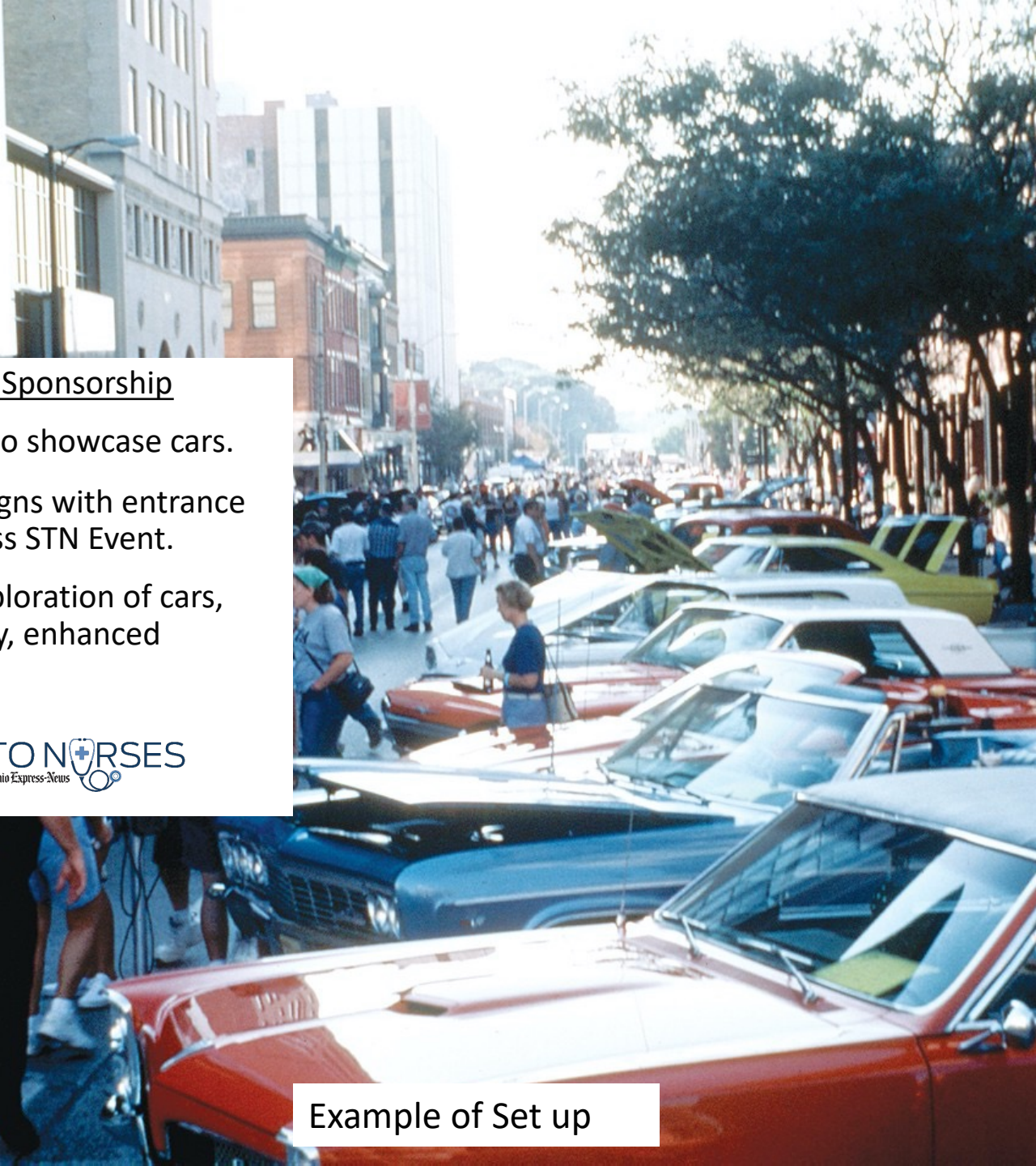
Example of Set up